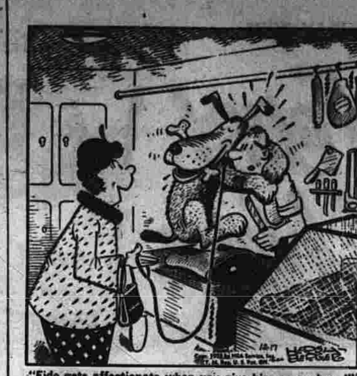
"Fido gets affectionate when you give him a coupon!"