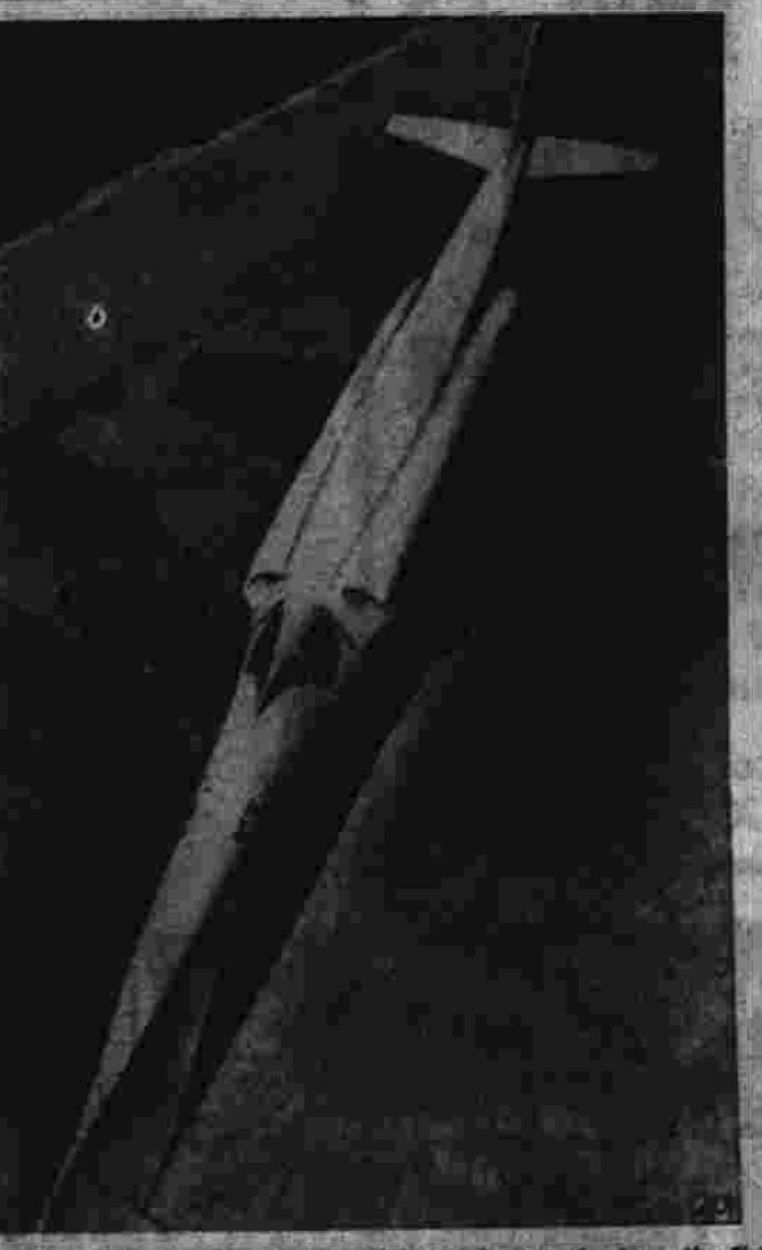
This is the Air Force's new high speed research plane, the X-5, nicknamed "Flying Stiletto" because of its sharp wings and long tapered nose. A jet, strikingly similar in design to the one above, the Bell X-1A, dashed to a new unofficial speed record of 21,100 mph the speed of sound in recent test runs, according to aviation circles. The X-1A is one of a series of experimental ships which began with the Bell X-1 which passed the speed of sound (sonic barrier) in 1947.